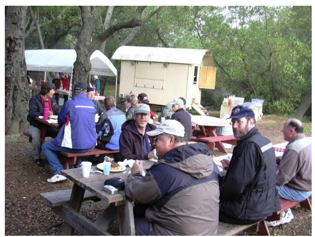
The food was pretty good, catered by the local Lions Club.