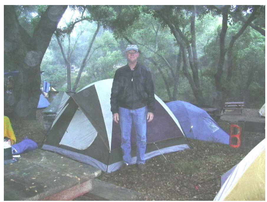
Here I am next to my tent.