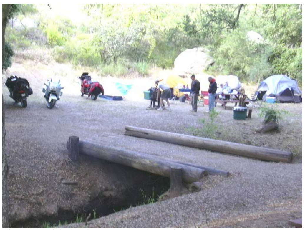
These guys picked a nice spot across the creek that runs through the campsite.