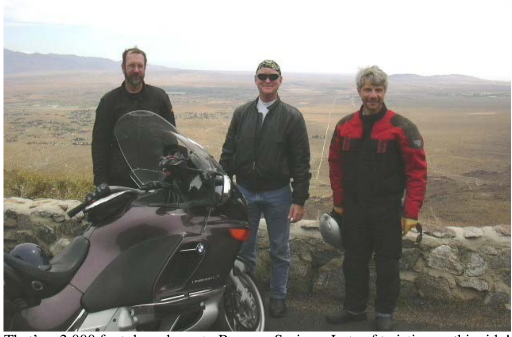
That's a 2,000 foot drop down to Borrego Springs. Lots of twisties on this ride! (That's me in the middle with my bike.)