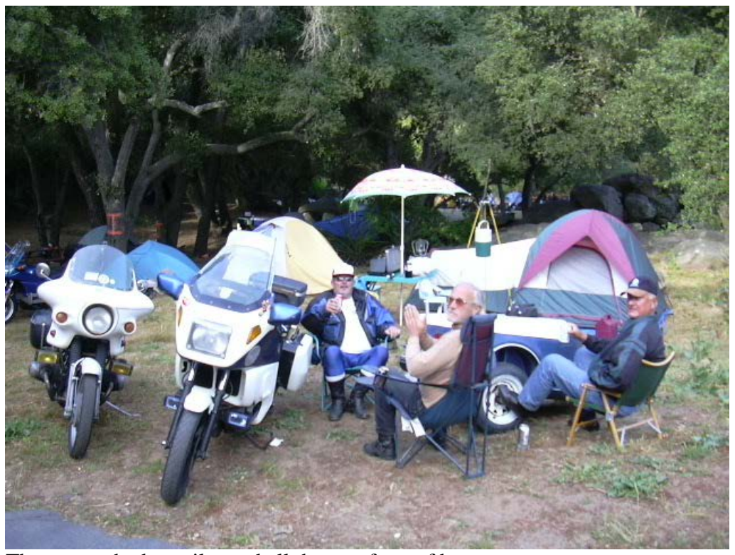
These guys had a trailer and all the comforts of home.