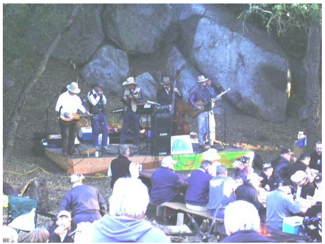
They were pretty good!