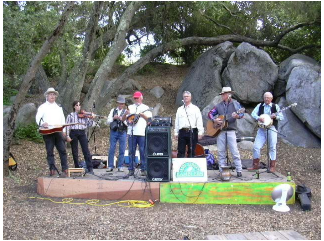
They're the Ash Street Ramblers, if you're looking for a good bluegrass band.

The weather held up pretty good, but I had to ride home in the rain. So now I have to go dry out my tent and gear.