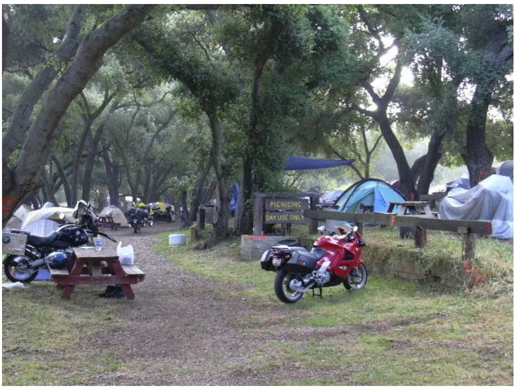
No 4-wheeled vehicles allowed! Just bikes and tents.