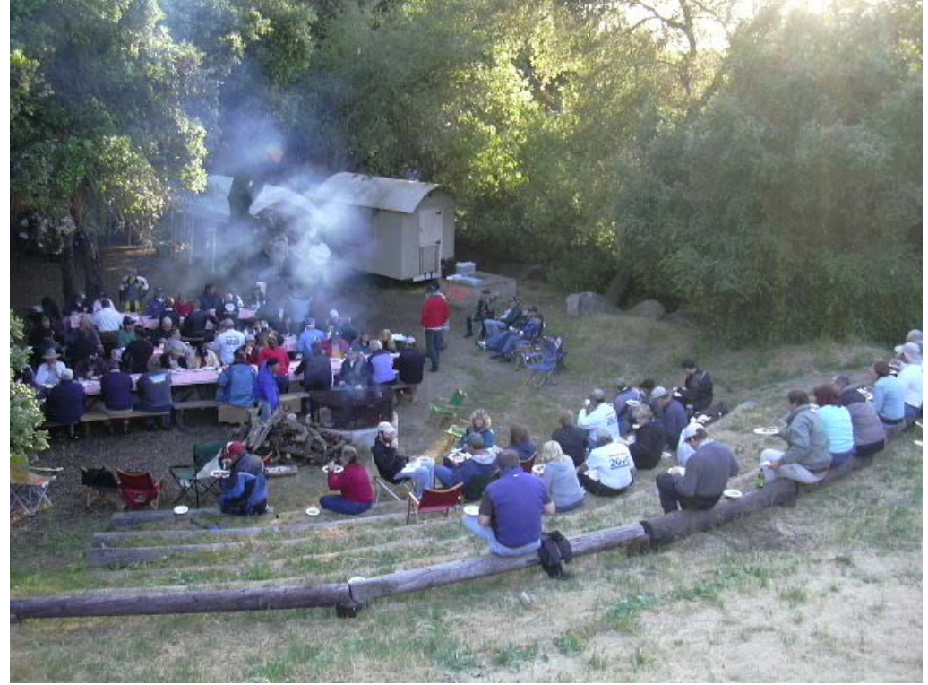
Saturday night dinner was great – barbequed pork, turkey and roast beef!