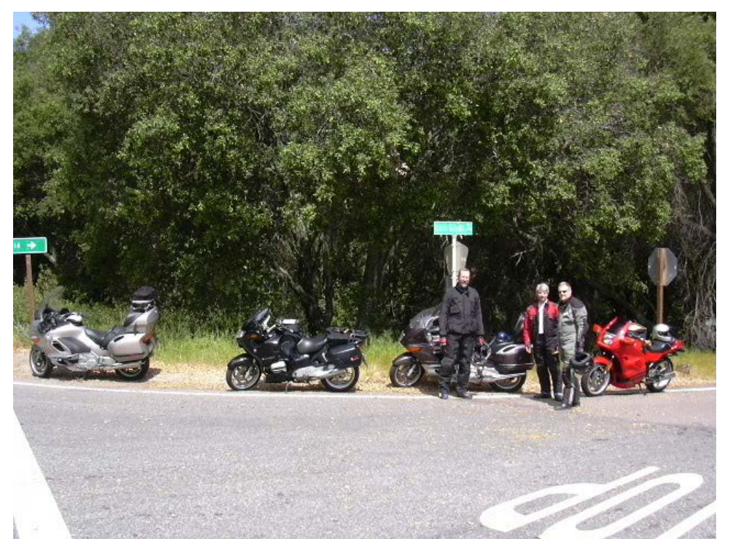
Saturday we all went for a ride to Mt. Palomar and out to Borrego Springs – about a 200 mile ride that took most of the day.