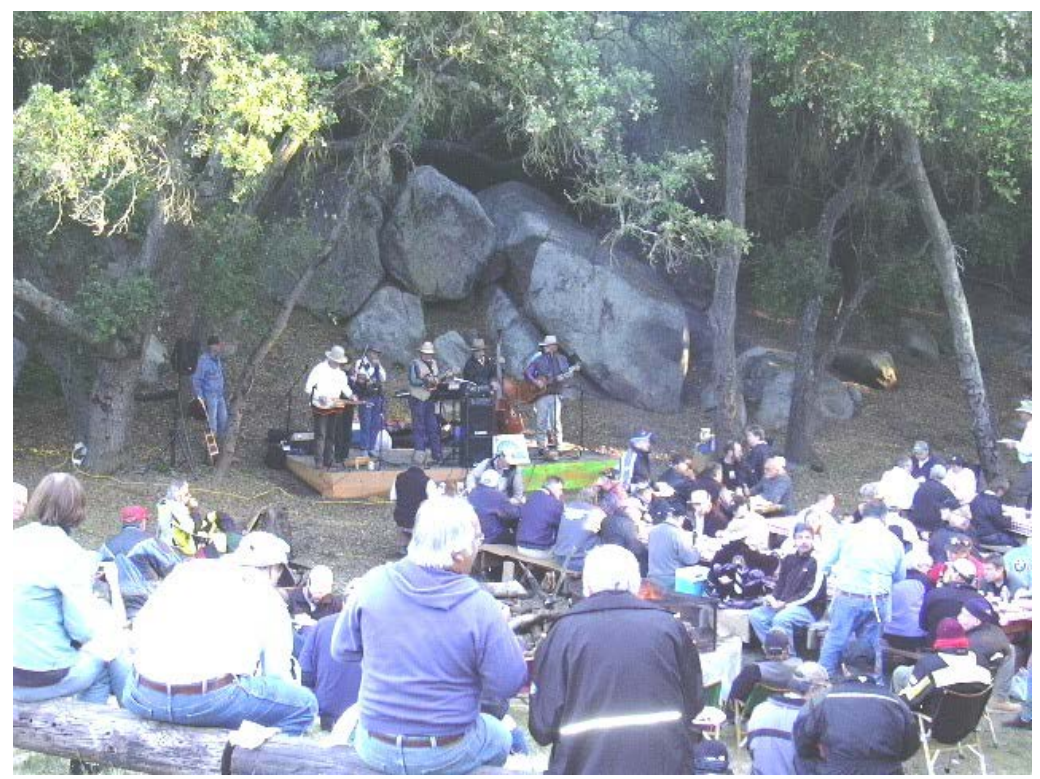
After dinner, these guys provided the entertainment – bluegrass music.