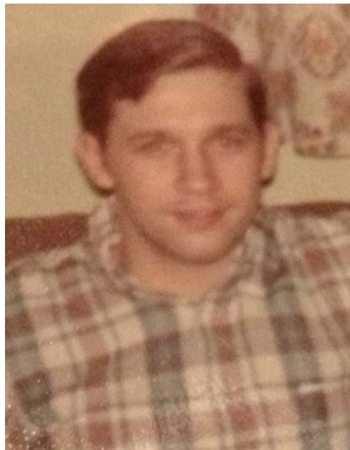
NEWSLETTER: David Omlor - - - - -